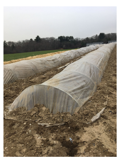
Figure 4: Notice soil shoveled up on sides of the tunnels to secure plastic sheets in place.

Ensure hoops are strong and sunk deep in the soil. Ensure plastic is tight with no sagging. Pile soil up at the edges of the plastic (see picture) to firmly secure the plastic in place for the winter. Steve reports that they rarely see collapse using this method unless there is extra heavy winter snow fall such as with the winter of 2015. They use recycled/ reused greenhouse plastic in 8' x 10' feet wide in 50' to 100' sections. The plastic sheets are removed in spring ideally when dry to keep them clean in storage and folded for reuse again the following fall.