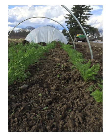
Figure 6: Freshly weeded carrot bed in early spring.