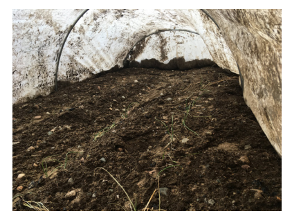
Figure 5: Tiny onion transplants inside low tunnel in December.