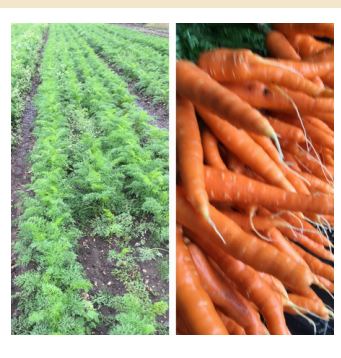
Figure 2: Carrots with fresh green tops can add a lot of value to a winter or late spring CSA.

Tangerini Spring Street Farm (TSSF) has been growing in Millis, MA since 1994 and is a diverse vegetable, fruit, and animal farm which seeks to grow healthy, high quality produce in a way that enhances the land and the community around them. They have been overwintering carrots for many years and also have begun to experiment with overwintering onions. They have a unique pick-your-own winter greens CSA that draws a dedicated base of customers from the local community. Steve Chiarizio, TSSF's farm manager, oversees much of the overwinter growing and harvest