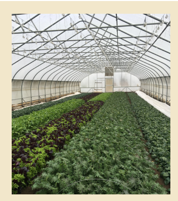
Figure 1: Greens for a pick-your-own CSA.

Tangerini Spring Street Farm in Millis, MA